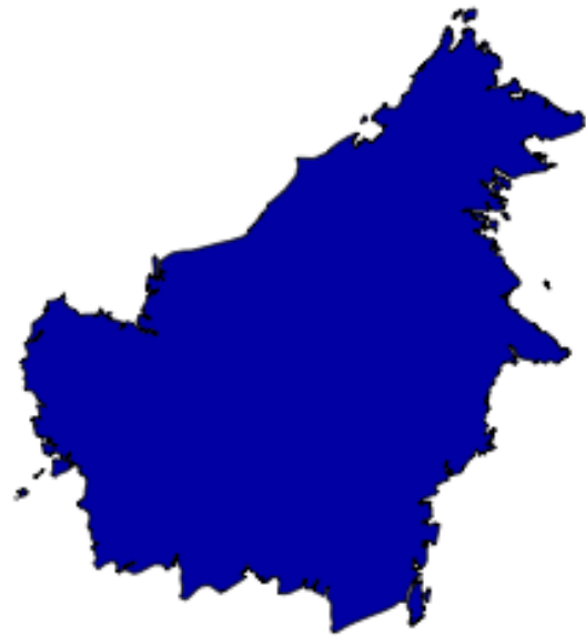
Figure 4: Example of a more complex customized study area representing the Borneo montane rain forests ecoregion from Olson et al. (2001). Only grid cells within the red area are included in the sampling bias calculation.