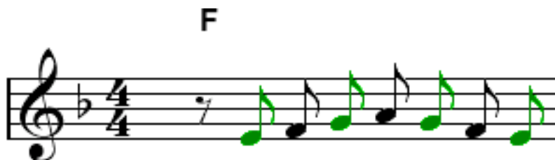
Changing direction in a scale

In using both scales and arpeggios, direction changes during the figure can provide variety and increase interest. Here are a few examples.