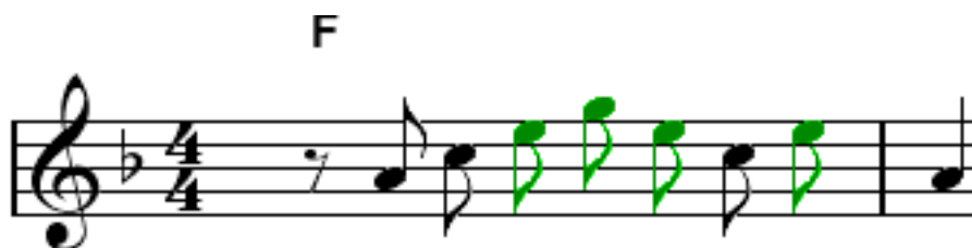
Changing direction (twice) in an arpeggio