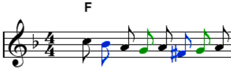
Approach tones (shown in blue)

In the preceding example, the Bb is also ok because it approaches the chord tone a half-step away. This idea is often used to get a “jazzy” sound, even with notes that are not in the scale. Here is an extension of the previous example. Note that the F# is not remotely consistent with the F major chord, but it “works” because it approaches the G, which is a color tone over the F major.