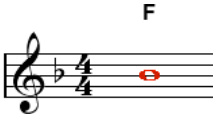
An “avoid note”

“Avoid note” is the jazz player’s term for a note that is in a common scale for a chord, but which shouldn’t be sustained (say longer than an eighth-note) over that chord because it is very dissonant, to the point of sounding harsh. In a way, it is saying that the scale should actually be reduced to a smaller scale in this particular intended use. An example of an “avoid note” is the fourth of a major scale over a major chord. If played in the octave above the chord itself, this note creates a minor-ninth over the third of the chord, which sounds discordant. Short notes of the same pitch are not generally a problem and can be used in passing.