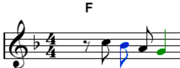
Scale fragment with chord tones off the beat

In playing with scale fragments, it is best if chord tones are hit on the beat rather than off, unless an appoggiatura (from the Italian word appoggiare , "to lean upon") effect is desired. Below is the line from above staggered so that the chord tones are off the beat. While the Bb could be regarded as an appoggiatura, it is not really held long enough to have that effect.